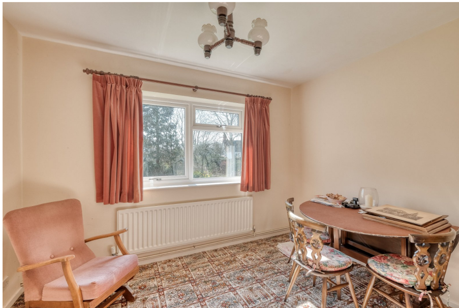
Old Forge, Whitbourne, Worcester